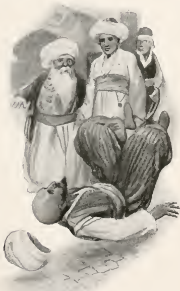
The man was seized and flung violently to the ground. (P. 304.)

of a reward. So he asked to be given one evening a week for his own amusement, either to take a walk or to spend it as he wished, and Kalum-Bek, who knew his assistant had too much good sense to attempt to escape without money, readily granted him the favour.